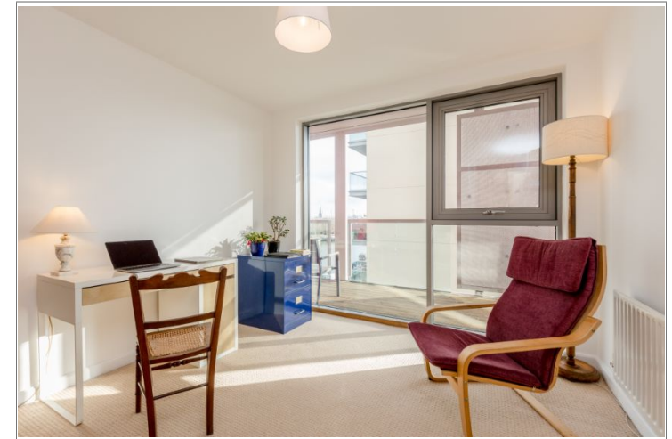
THIRD FLOOR 954 sq.ft. (88.6 sq.m.) approx.